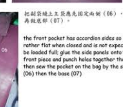
把副袋縫上至袋底先固定兩側 (06)，再做底那 (07)。

the front pocket has accordion sides so it is rather flat when closed and is not expected to be loaded full; glue the side panels onto the front piece and punch holes together then stitch; then sew the pocket on the bag by the sides first (06) then the base (07)