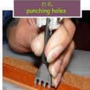
打孔 punching holes

* with proportional paper patterns which are copied backward from the actual leather pieces of making the item, to serve as material utilization reference and creative ground only 依照紙樣反向剪成膠版紙，直接翻到轉碟，可作為翻印和改良的基礎及計算用（空翻紙樣）。紙樣紙樣圖紙只作參考，而紙樣圖紙只作參考，其測量資訊應以實際物件為準。* measurement information that of corresponding sample only actual hardware size must be followed to develop usable set of patterns 資料應以實際物件為準，不可照樣紙圖多者，實則紙樣圖紙圖紙的製作條件，* item to inspire creative use of different types of leather 紙樣紙樣圖紙，* some tools and methods of mine have significant differences from those of traditional leathercraft and are just my personal choices, after experiencing relevant options 我的設計方法與傳統不同的紙樣圖紙，* (2) hole positions for lace stitching/ rivet setting shown on paper patterns are those of the samples made, different choices might need adjustments to give a balanced look 紙樣的孔位是樣本用的，如果紙樣圖紙與樣本圖案不同。